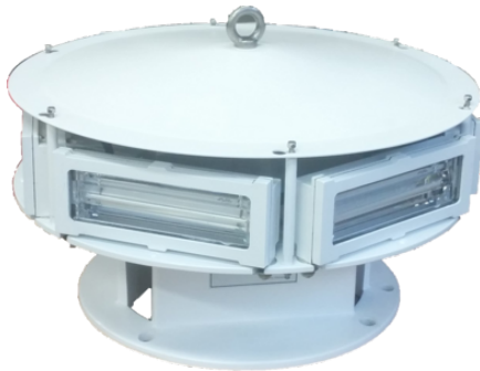
Patents: EP 1966535B1 &amp; US 7816843