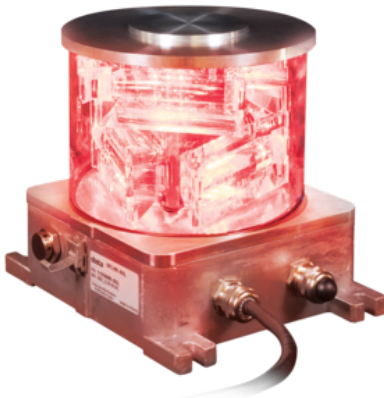
Patents: EP 1966535B1 & US 7816843

Red medium intensity FAA L-864 (AC 150/5345-43J) ETL certified