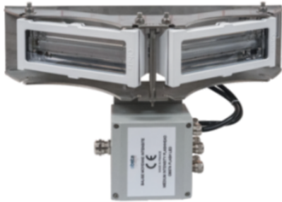
Patents: EP3230651, FR1462349, Pat. 10,247,386

This dual color medium intensity is designed for day and night marking of obstacle such as chimneys, pylons and high rise buildings (3 or more lights are required per level depending on diameter of the obstacle)