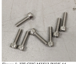
Figure 1: YIS CHC M3X12 DNOX A4

Command card for 8 dual color OBSTA projectors