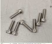
Figure 1: VIS CHC MSX12 INOX A4

Command card for 8 dual color OBSTA projectors