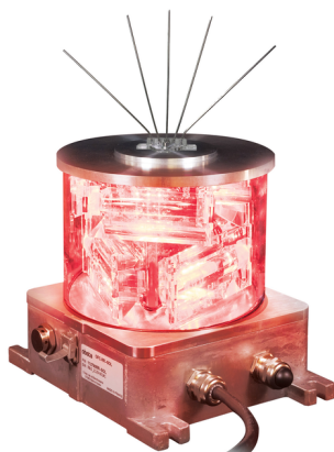
1966535B1 &amp; US 7816843