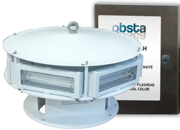
Patents: EP 1966535B1 & US 7816843

Photocell P/N100757, optional L-810 (F) at mid level and cable between power cabinet and flash-head to be ordered separately