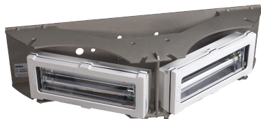
EP3230651, FR1462349, Pat. 10,247,386