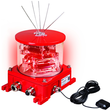
Patents: EP 1966535B1 & US 7816843