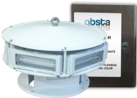
Patents: EP 1966535B1 & US 7816843

The obstafash system dual color or white only provides a day and night marking solution for all kind of obstacle higher than 45 meters. For obstacle below 150 meters the use of white or dual color flashing light L-865/L-864 during day time eliminate the need to paint the obstacle with red and white stripes)